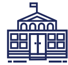
Academic institutions and associations